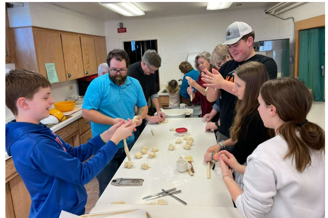
Youth Group members help to prepare pretzels during Sunday School.