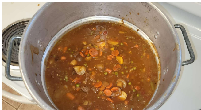
Beef stew is prepared and ready to be served at the Maundy Thursday dinner.