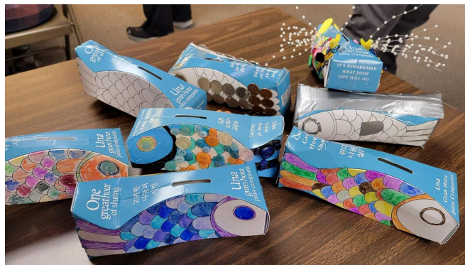
A few colorful fish donated on Palm Sunday.

education, clean water, and food so greatly needed by those who thirst and are hungry and willing to learn around the world. Thank you for making the 2024 One GREAT! Hour of Sharing a fun and meaningful Lenten experience.