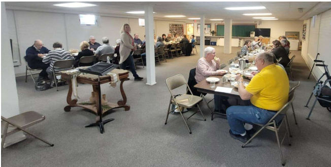
Congregation members dine together over beef stew ahead of the Maundy Thursday service.