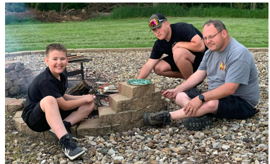
Youth Group members and Parents enjoy a campfire.