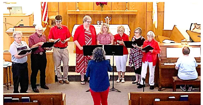
The choir performs during Pentecost worship.

The Tedrow's invite the congregation to celebrate Anna's graduation with a cake following worship on June 2.