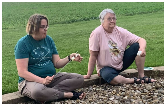
Youth Group members and Parents enjoy a campfire.