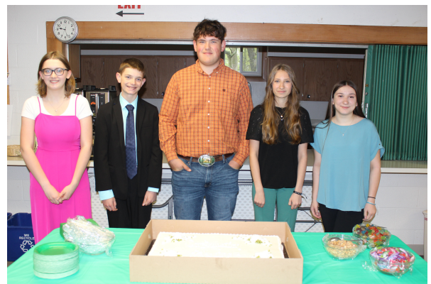
Confirmation kids pose in front of their reception cake.